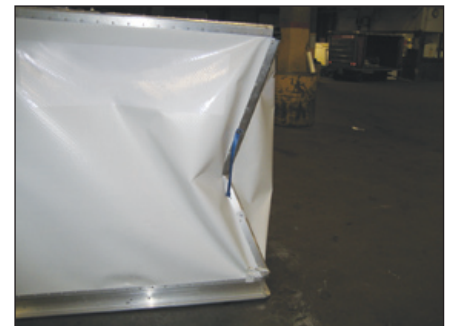
Figure 2: Both loaded units were impacted at same height and angle by a fork-truck

distributing dynamic and impact loads through the entire structure.